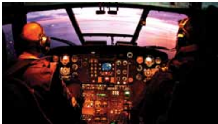
Captains Aaron Rainbow (left) and Rosh Jaypalan in flight at sunset over the Baltic Sea.

We based in Bornholm, Denmark when the southern section of the pipe was being laid; in Visby, Sweden for the central section; and Turku, Finland for the northern section. In Bornholm, we had the longest and coldest winter in 14 years, with snow up to 20 feet deep in places, in January 2011. Summer in Visby meant beaches and barbecues, and Turku was busy with shows and concerts as it was named the European City of Culture.