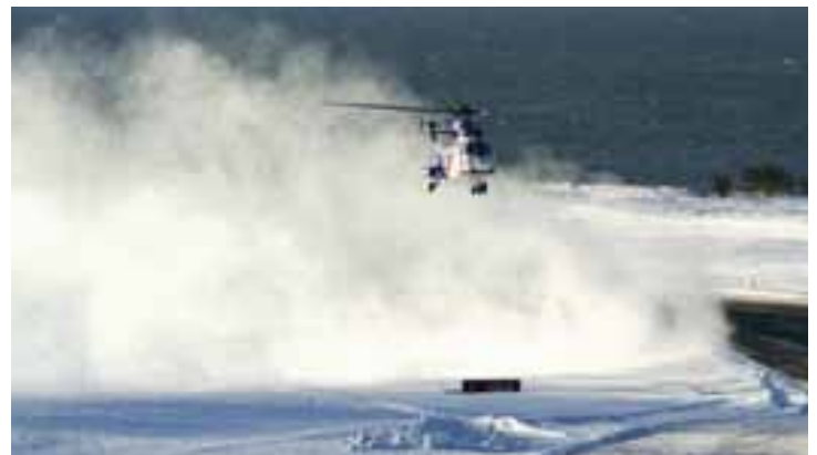
Winter in Denmark in 2011 was the longest and coldest in 14 years.