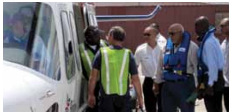
Guyana President Donald Ramotar (center, wearing blue vest) prepares to board an AW139 for the first leg of his visit to two offshore drilling rigs.

ground crew was excellent. “I commend our crews for their professionalism and the way they completed their tasks today,” he says. “It was a job well done and our clients were very pleased.”