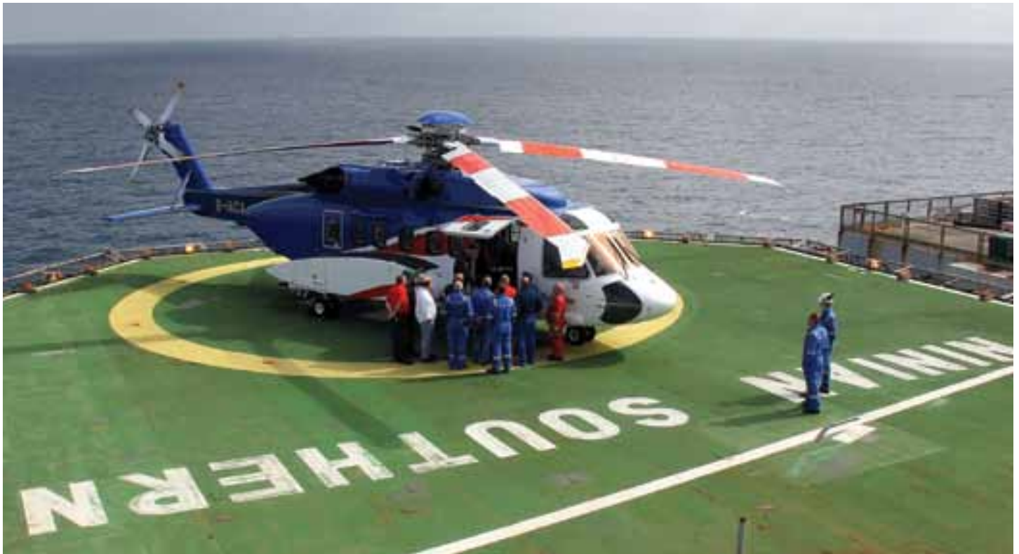
New contracts involving 20 large helicopters may increase Bristow's revenue by more than $2 billion.

In a flurry of winning bids, Bristow secured several major new multi-year contracts for the provision of 20 large aircraft that are expected to generate in excess of $2 billion in revenue.