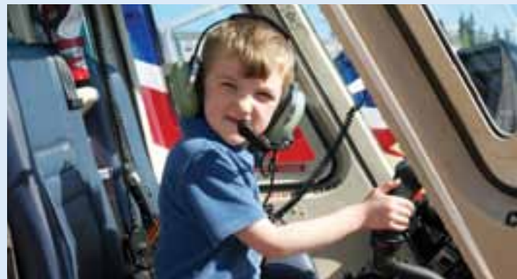
Bristow's Bell 206L-4 is always a big hit at the Fairbanks Truck Touch. Could this be a Bristow Academy graduate, class of 2024?

For the third straight year, Bristow Alaska brought a Bell 206L-4 to the Fairbanks Truck Touch fund-raising event, adding a new dimension to a day designed to inspire children about what they might want to be in the future. The event supports the Open Arms Child Development Center and lets children and parents explore fire trucks, police cars, rescue vehicles, construction equipment, classic cars - and a helicopter.