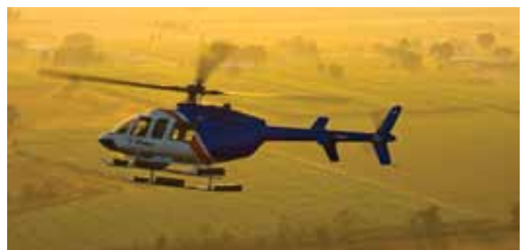
The Academy uses a fleet of three Bell 206 aircraft for its mountain operations training.