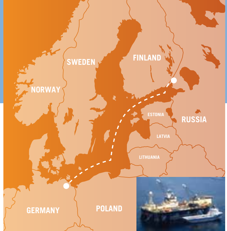
Bristow successfully supported the world's longest subsea pipeline project for client ENI Saipem in the Baltic Sea.