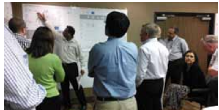
A global team identified more than 200 flight operations business processes as part of a project to develop a next-generation integrated software platform.

In September, the steering team will meet again to review the results of the elaboration phase before we advance to the construction phase. At the September meeting more concrete plans for deployment will be discussed and likely agreed to.