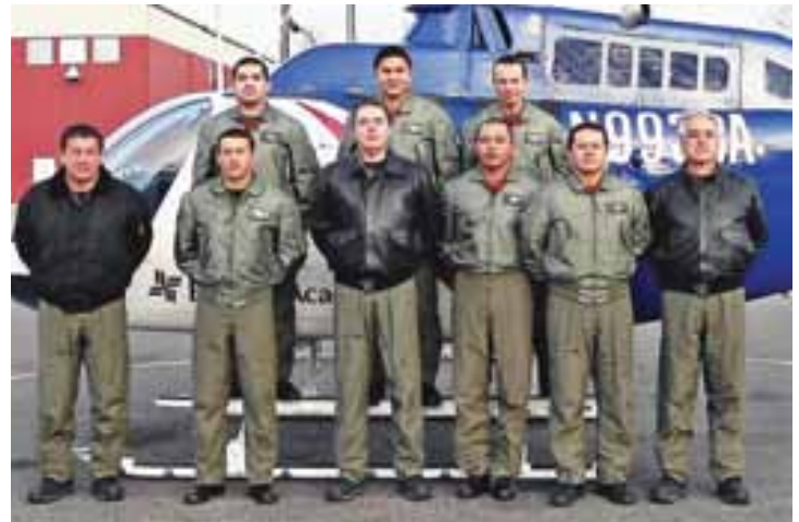
The Colombian army has sent more than 60 officers to the Bristow Academy facility in Carson City, Nevada for mountain training, with more on the way.